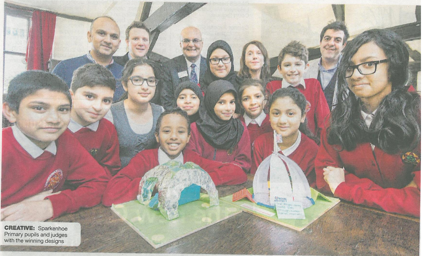
CREATIVE: Sparkenhoe Primary pupils and judges with the winning designs